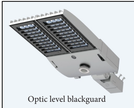
Optic level blackguard