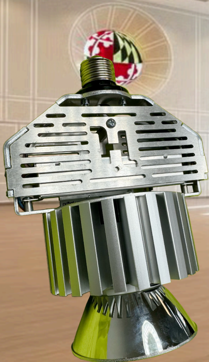
HiLUMZ TROVE LIGHT